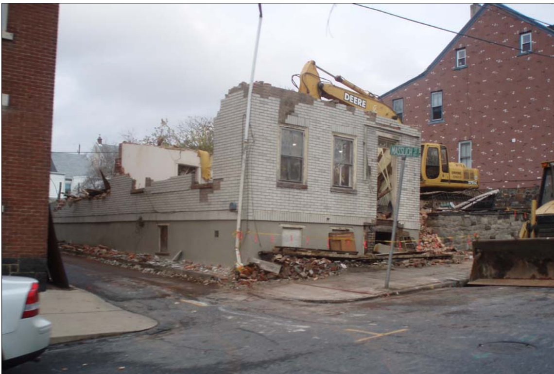
Above, photograph taken during demolition in preparation for Moravian IV.