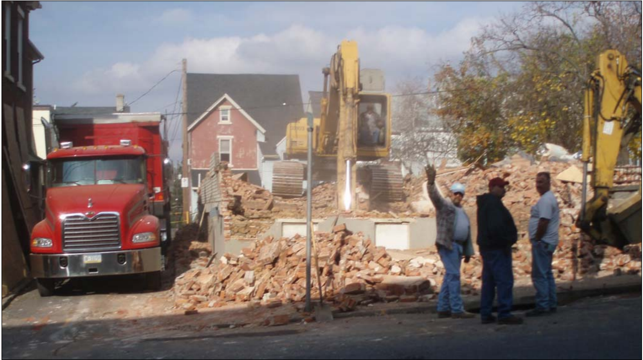
Above, photograph taken after demolition in preparation for Moravian IV.

(Innovative Housing continued from page 1) continue seeking additional funding sources. We began to have discussions with our HealthChoices Unit that resulted in the successful allocation of $750,000 in HealthChoices Reinvestment funding for this project. The City of Bethlehem added $260,000 to this project from some of its Federal HOME funds and the PA Department of Community and Economic Development contributed $254,600 toward Moravian IV. The City also applied on behalf of the Moravians for PA Housing and Redevelopment Assistance funds from the Commonwealth of PA. These state funds will be injected into the project through the City.”