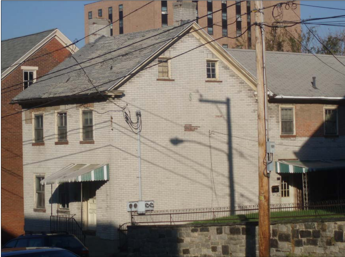
Above, photograph taken before the demolition in preparation for Moravian IV.